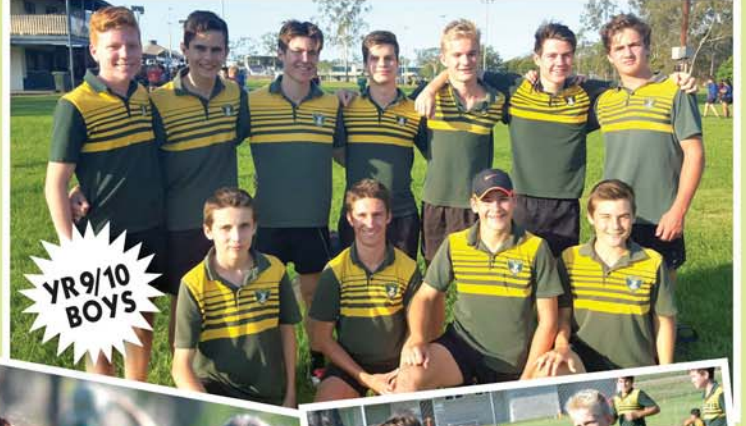
YR 9/10 BOYS