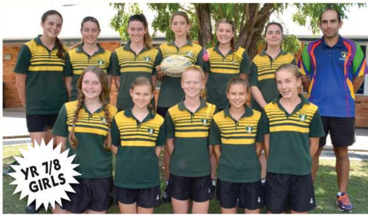
YR 7/8 GIRLS