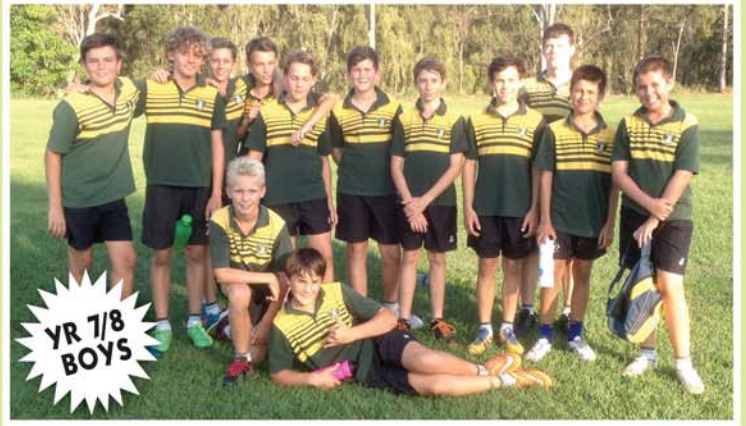
YR 7/8 BOYS