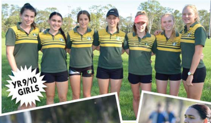
YR 9/10 GIRLS